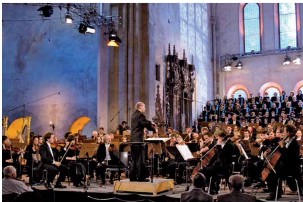
Opening concert in the basilica of Eberbach Monastery