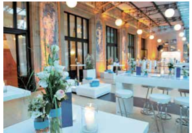
from above: Open-air concert at the Cuvéehof of Schloss Johannisberg Summer party at Schloss Johannisberg conservatory of Kurhaus Wiesbaden for the reception of guests