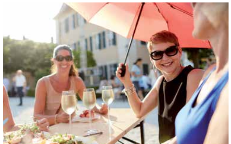
Summer feeling at Schloss Johannisberg rightmost: Sponsors' lounge at the baroque garden of Eberbach Monastery