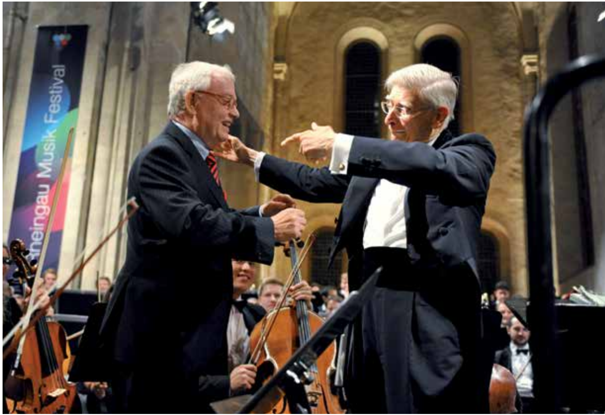
from above: Conveying thanks to Herbert Blomstedt and the Gustav Mahler Jugendorchester A warm welcome to a Cuban participant of the academy at Frankfurt Airport