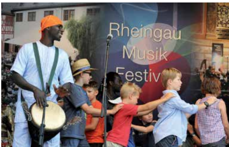
International family party "Around the Globe"