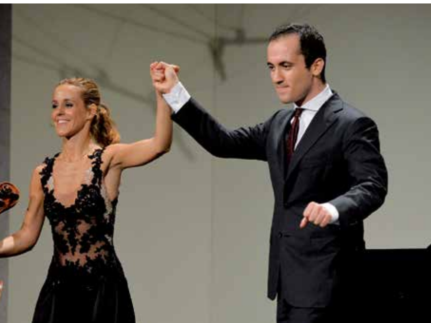
left: Sol Gabetta and Igor Levit – once young talents now stars of our times