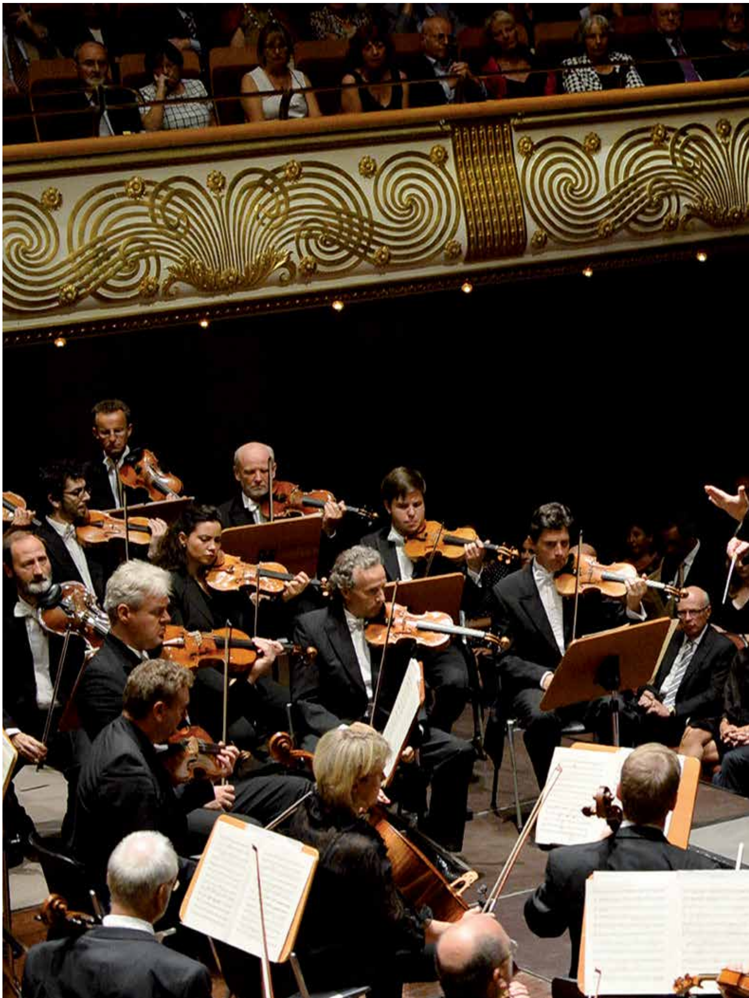
Daniel Barenboim and the Staatskapelle Berlin at the Friedrich-von-Thiersch-Saal of Kurhaus Wiesbaden