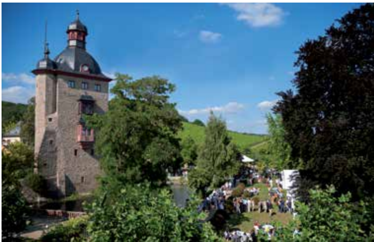
from above: Eberbach Monastery Castle Festival at Schloss Vollrads The unique "Steinberger Tafelrunde"

In summer, when the Rheingau and the Rhine-Main region unveil their splendour in all its true magnificence, music magically materialises between the Rhine and the vines, seeking out places where it feels most at home. Whether it's a large concert hall or a slumberously secluded winery , they all open their doors to provide the events with a befitting backdrop. The entire region becomes a gigantic stage for cultural events of global stature. Unique cultural monuments are transformed into concert venues: the famous Eberbach Monastery is suffused with grandeur and dignity, a princely ambience welcomes visitors to Schloss Johannisberg Palace, picturesque gardens lure guests to Schloss Vollrads, festive resplendence illumines the Kurhaus Wiesbaden, featuring one of Germany's most beautiful and acoustically perfect art nouveau concert halls.