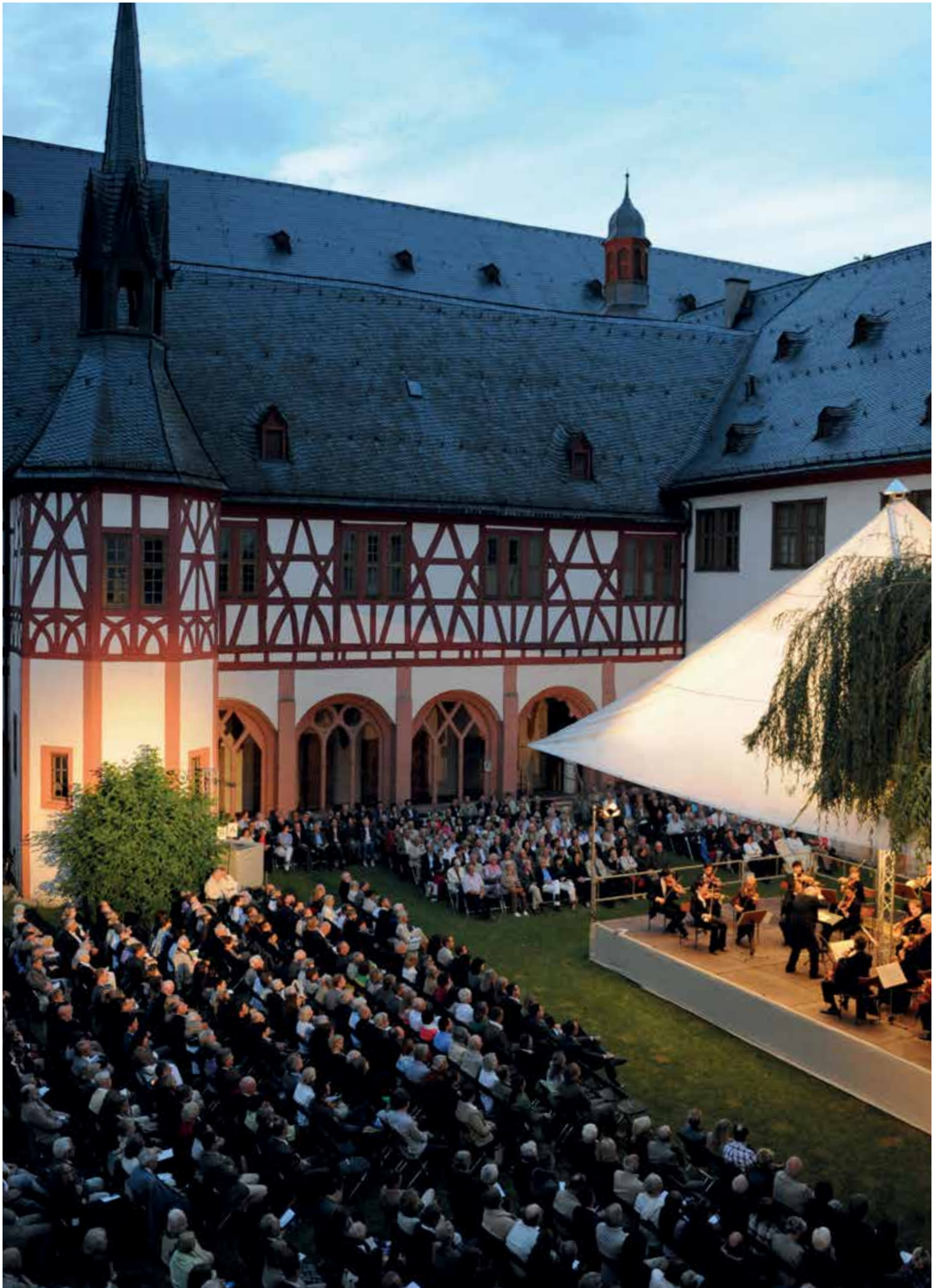
Concert in the cloister of Eberbach Monastery