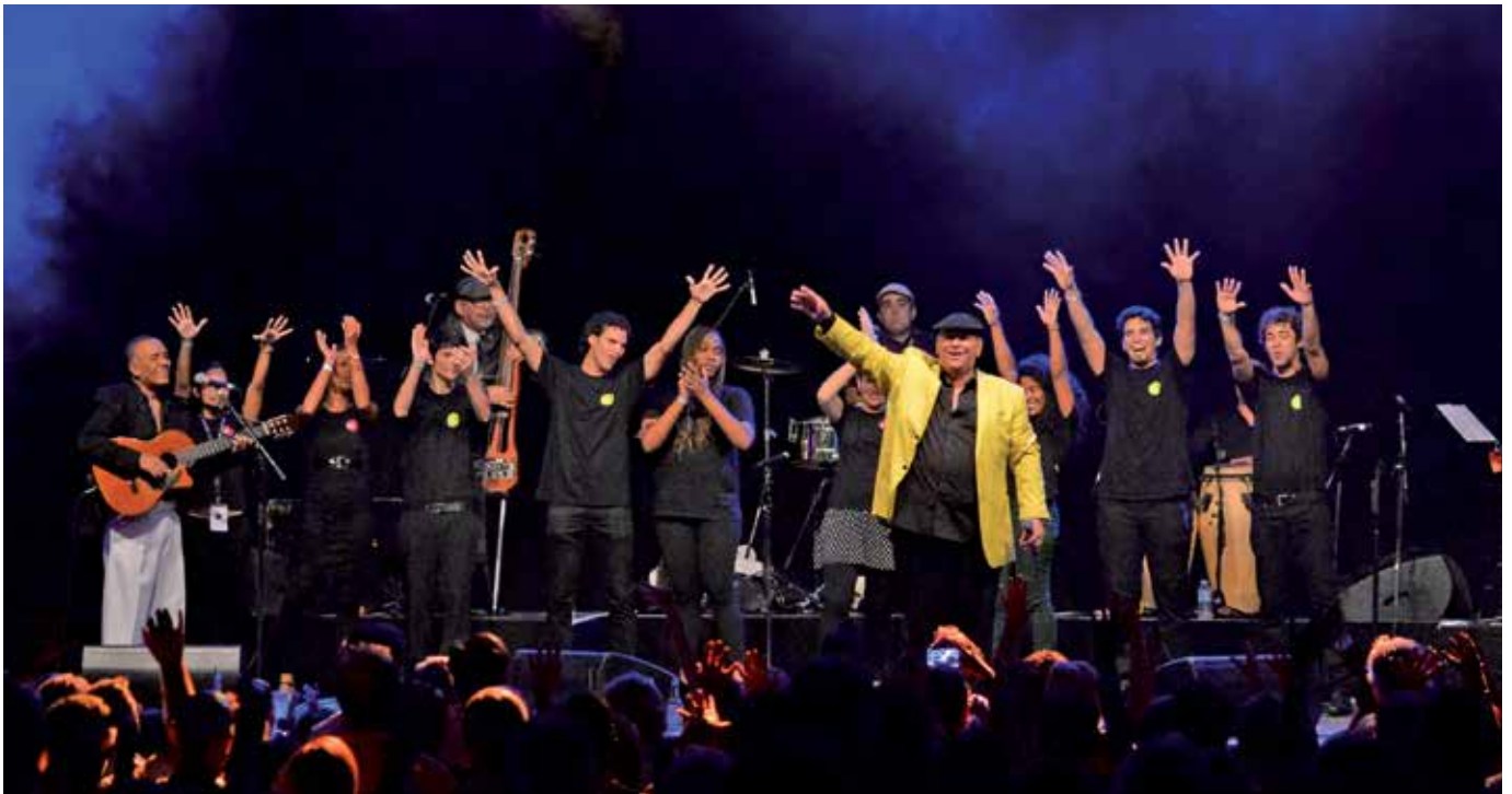
Cuban Night at "Schlachthof Wiesbaden" with Soneros de Verdad and academy participants