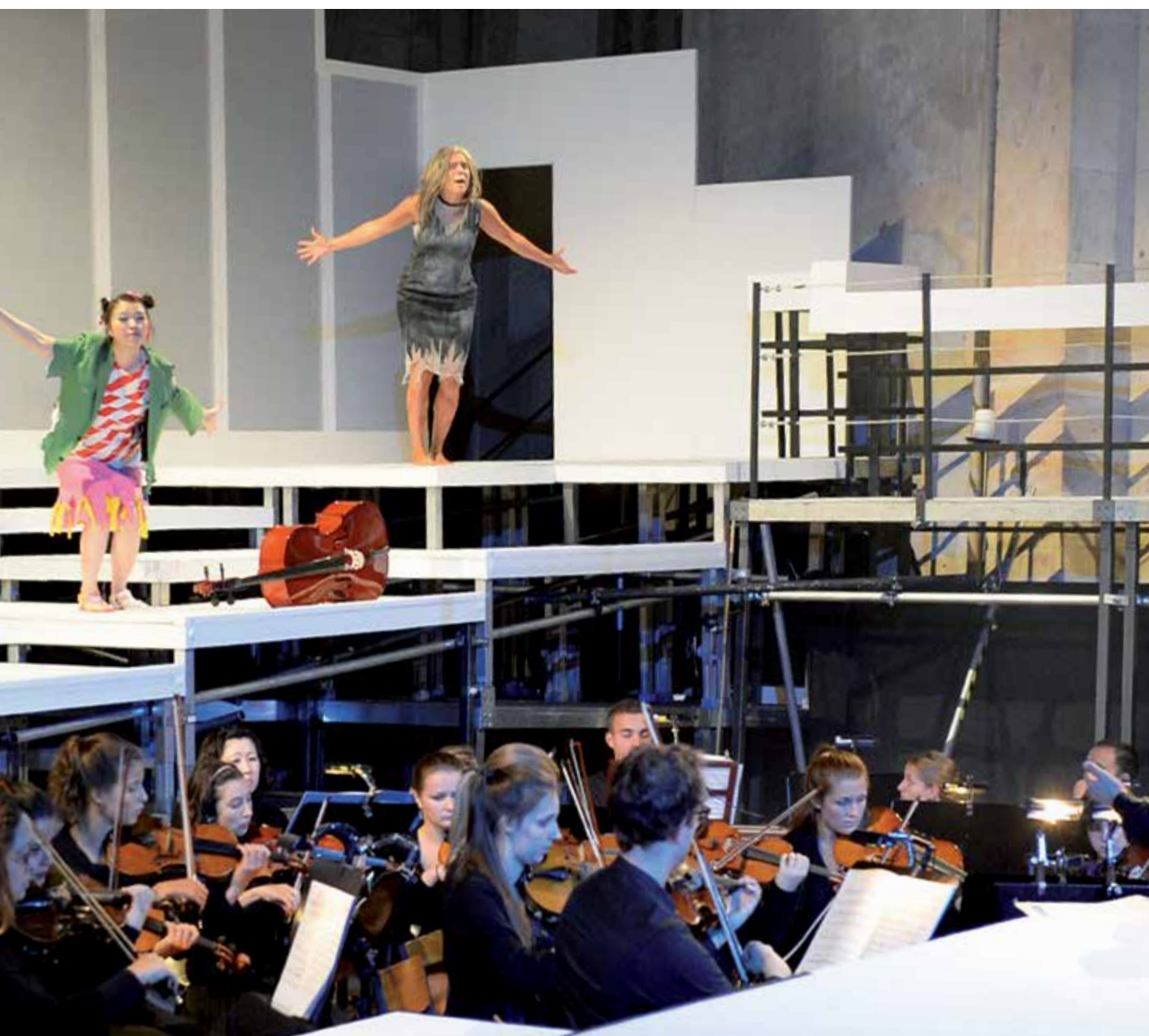
below: Baroque opera in the basilica of Eberbach Monastery, project in cooperation with the University of Music and Performing Arts in Frankfurt am Main